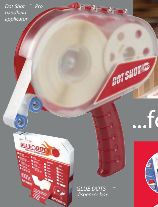
GLUE DOTS™ dispenser box